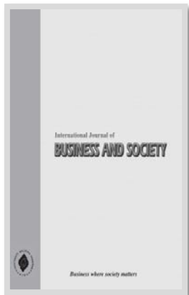
INTERNATIONAL JOURNAL OF BUSINESS AND SOCIETY (IJBS)