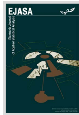
ELECTRONIC JOURNAL OF APPLIED STATISTICAL ANALYSIS

http://siba-ese.unisalento.it/index.php/ejasa