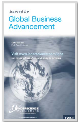
JOURNAL FOR GLOBAL BUSINESS ADVANCEMENT

Outstanding papers will be considered for possible publication in one of the following indexed by Scopus Journals :